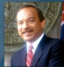
FORMER GOVERNOR JOHN WAIHEE III

With former Governor John Waihee, Ambassador of Goodwill: welcome the APEC delegation from China. Special guests and gifts.