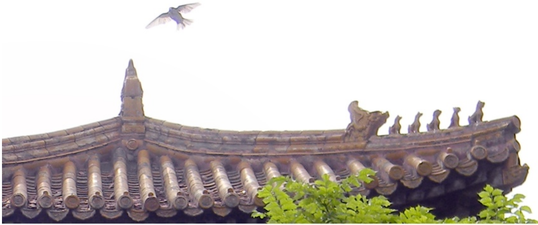
A dove flies over the rooftops of the Forbidden City, Beijing; July 4, 2011